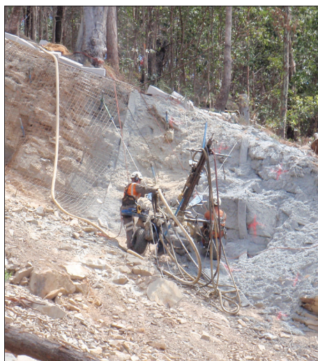
▲ TMR install rock anchors at the Beechmont Road landslide site

Work in the upper section, which involved cleaning, installing rock anchors and shotcreting is now complete.