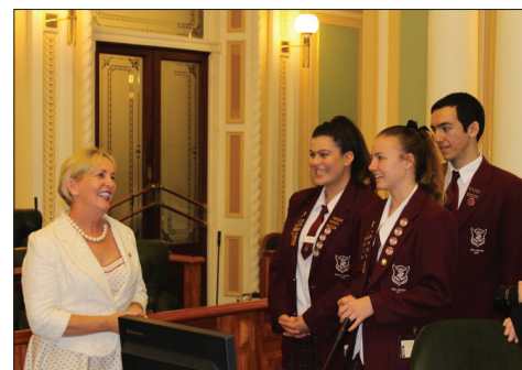
▲ Ros on the floor of the Legislative Assembly with St Michael's College students just minutes before Question Time

It was wonderful to have been able to show the students how their State Government works, and I look forward to maintaining my close relationships with all our local schools.