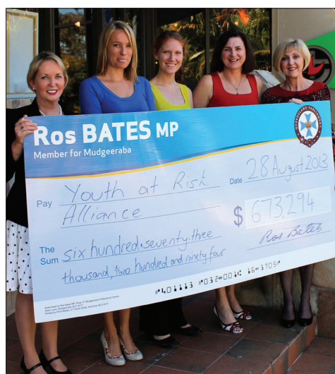
▲ Ros and Minister Davis present a cheque to the Youth at Risk Alliance

Upon our visit to the Youth at Risk Alliance in Robina, the Minister and I presented a cheque for more than $670,000 to the hard working staff to allow them to continue their efforts in supporting local at risk young people.