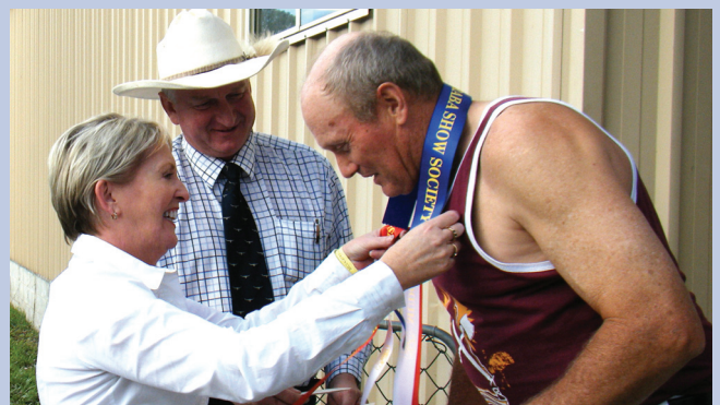
ATTENDED MUDGEERABA SHOW WITH SHADOW MINISTER FOR PRIMARY INDUSTRIES, RURAL & REGIONAL QUEENSLAND - RAY HOPPER MP