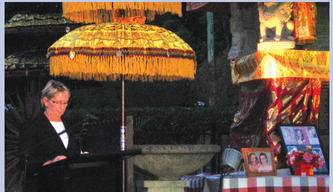
ATTENDED BALI BOMBING MEMORIAL SERVICE