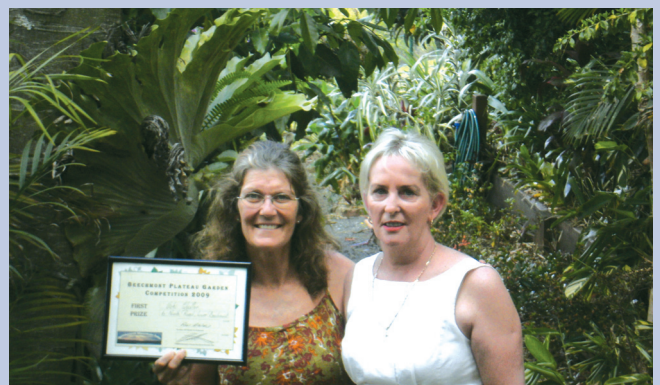
JUDGED THE INAUGURAL BEECHMONT PLATEAU GARDEN COMPETITION