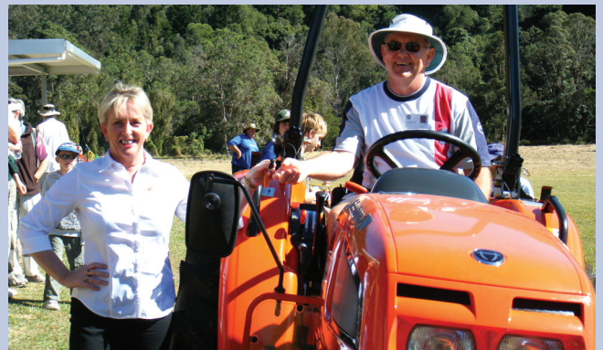
HANDING OVER THE KEYS TO A NEW TRACTOR FOR THE GOLD COAST MODEL FLYING CLUB