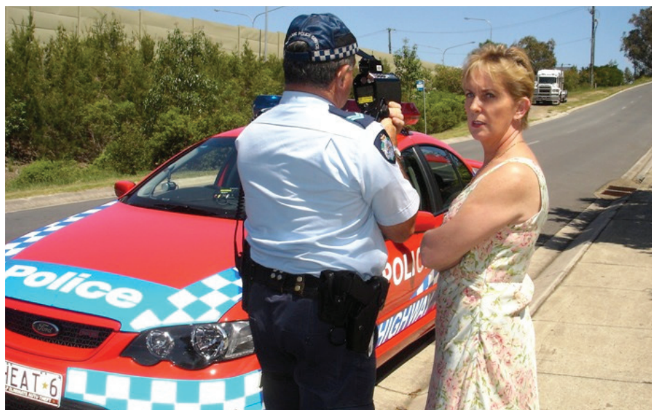
▲ Ros on Hinkler Drive