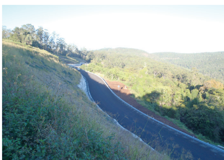
▲ Beechmont Rd has been reopened after significant roadworks

Residents in Lower Beechmont are finally getting the attention they deserve with $11.2M funded for much needed road improvements. After years of fighting the Labor Government we now have a magnificent, safe stretch of road between Tarlington Rd and Mirani