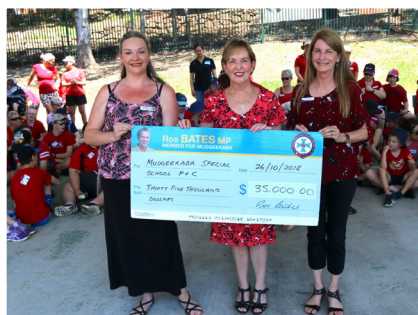
▲ $35,000 for Mudgeeraba State Special School