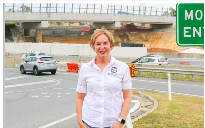
▲ Ros at the Stapley Drive bridge duplication site