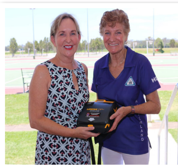
▲ A Comm Games defibrillator for Hinterland District Netball Association