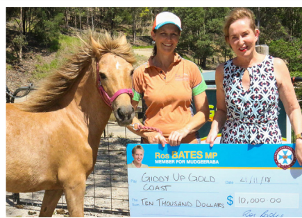
▲ $10,000 for Giddy Up Gold Coast