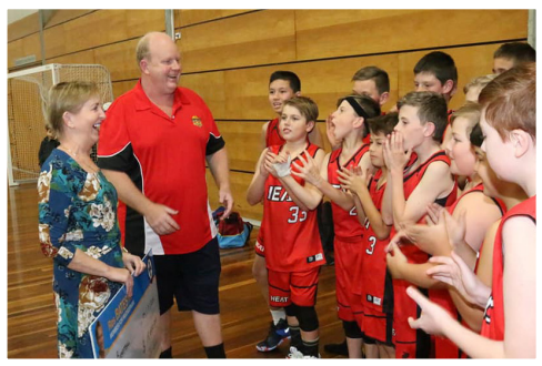
▲ $15,000 for Heat Basketball Gold Coast