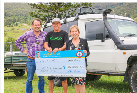
▲ $35,000 for the NV Gravity Park in Numinbah Valley