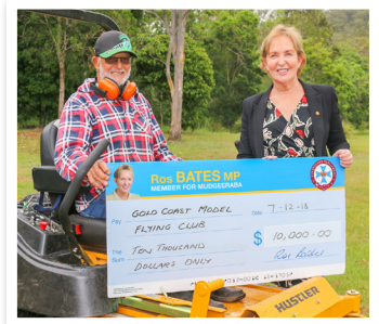
▲ $10,000 for the Gold Coast Model Flying Club

You can subscribe to my monthly eNewsletter, Ros' Rounds , for information on upcoming grants. In addition I am always happy to provide letters of support to not-for-profit organisations who are applying for government funding.