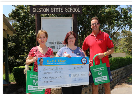
▲ $1,000 for Gilston State School P&C