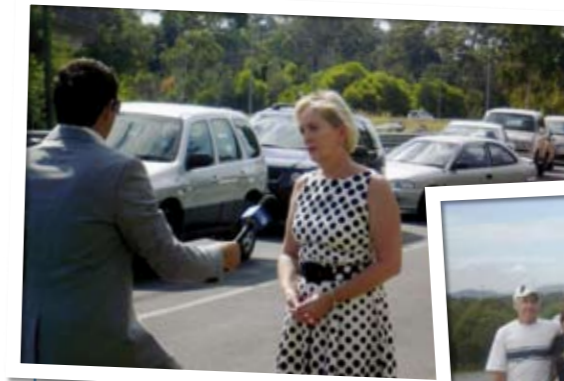
← Ros talking to the media about extending Old Coach Road.

Recent traffic counts on Old Coach Road reveal that in excess of 2000 vehicles utilising the Gemvale Road roundabout daily wish to travel southbound. I am currently working on getting Old Coach Road extended to Exit 89 at Bermuda Street, where a mere 300m of bitumen would help ease congestion at Exit 85.