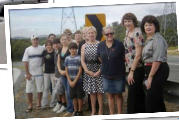
▶ Ros and Shadow Minister for Main Roads & Transport, Fiona Simpson MP with concerned locals on Worongary Road

Residents can ring the Main Roads Traffic and Travel Information number 13 19 40 to get real time updates on the M1 traffic conditions prior to leaving home, and avoid the frustration of sitting in traffic gridlock.