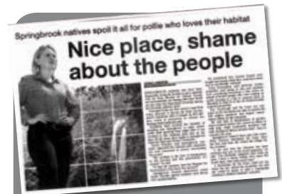
Gold Coast Bulletin 4/5/2010